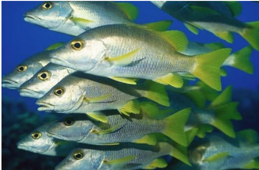
Yellow Tail Snappers